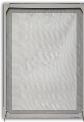
After correct positioning